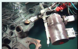
Dismantling and Decommissioning

Use Engineering and consulting services for small modular reactor(SMR) Description NSSS&BOP Design and Analysis, Owner's Engineering, Project&Construction Management, Licensing Support for SMR, Supply Chain Management for Nuclear Power Plant