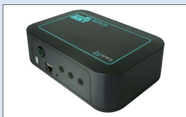
Data Collecting Device (comEL-MINT)

Use Data acquisition from measuring instruments Description Power quality analysis and optimization of energy management schemes