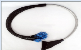
Optical module and fiber bundle for CES cassette

Description An optical module for carrying out various optical diagnostics simultaneously and an optical module for transmitting the optical signal acquired from the optical module to the diagnosis room