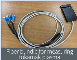
Fiber bundle for measuring tokamak plasma

Description An optical module for carrying out various optical diagnostics simultaneously and an optical module for transmitting the optical signal acquired from the optical module to the diagnosis room