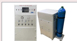
Supercritical fluid manufacturing device for machining of difficult-to-cut materials

Description Unlike existing disinfection devices with mercury ultraviolet lamps, UV-C LEDs emit only ultraviolet rays optimized for sterilization, and is effective in sterilizing more than 99.9% of E. coli, pathogenic microorganisms, bacteria, and viruses